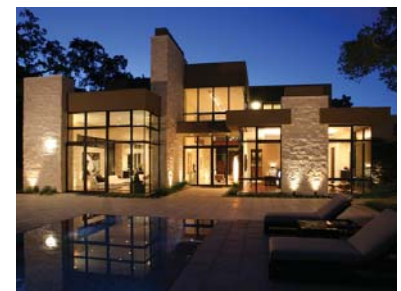
Orinda Residence, California Light Pollution Reduction