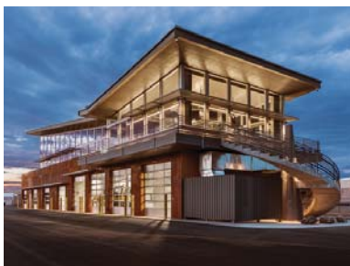
Scottsdale Airport Operations Center, Arizona LEED Certified